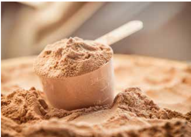
Micronization for Life Science