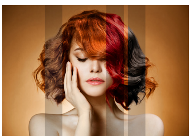
For example: micronization for hair coloring

Since 2002 ACU is contract manufacturing in the field of cosmetics. For this very demanding sector we are a competent and efficient partner pursuing a unique quality concept with consistently high production and quality standards. Our production solutions are always tailor made to your individual needs.